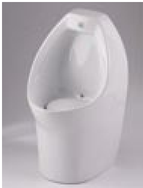
Falcon Waterfree Technologies